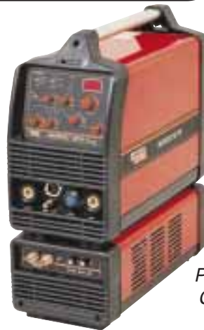
Pictured with Cool-Arc 20